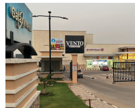
Galaxy Mall Kaduna