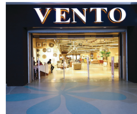
Jabi Lake Mall Abuja