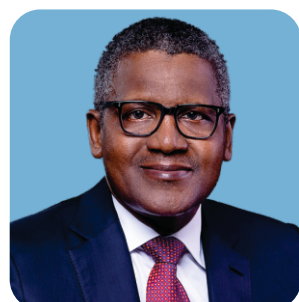
Alhaji Aliko Dangote Chairman, Dangote Refinery and Petrochemicals Co. Ltd.