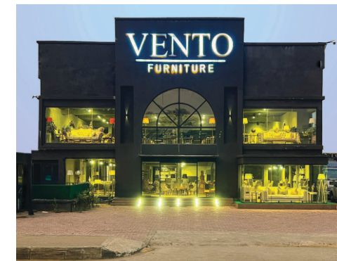
Azikiwe Road. PHC