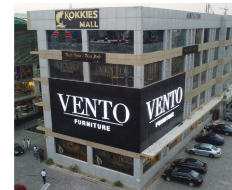
Kokkies Mall Wuse 2 Abuja