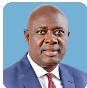
H.E. Heineken Lopokbiri Minister of State for Petroleum Resources (Oil)