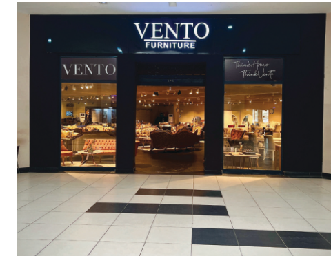
Festival Mall Festac Lagos