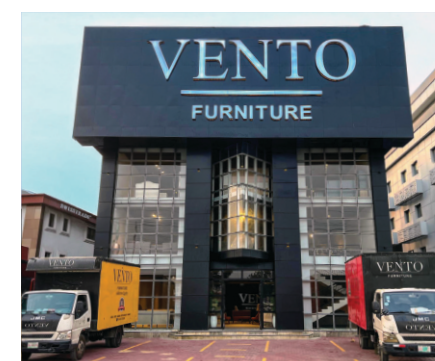
Ajah, Lekki II, Lagos