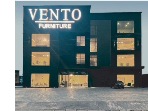
Peter Odili Road. PHC