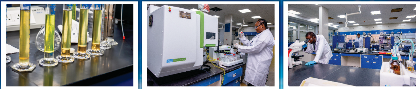
Refinery Testing Laboratory

World's largest single-train refinery and petrochemicals, ushering in Nigeria's new economic era.